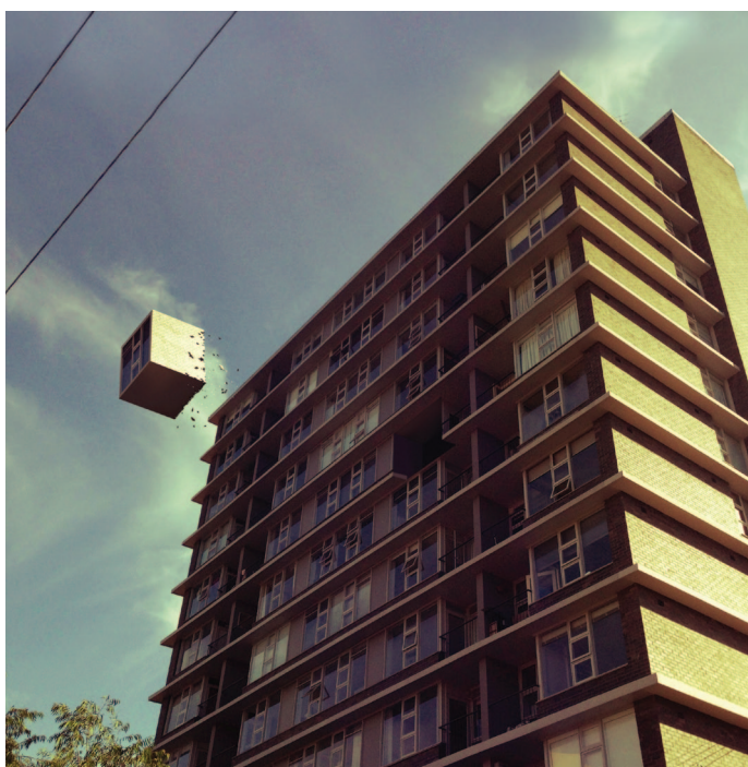
Muhammad Shono, Displacement 33 , 2013

Exhibition from 31 October 2018 to 17 March 2019